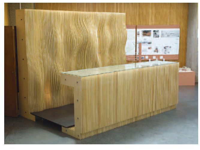
'Centenary Bar' at Sheffield University's School of Architecture, CNC machined Grade S/BB Birch Plywood with WISA-Hexagrip floor.