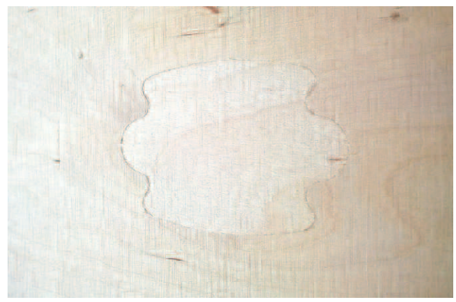
A 'Batman' shaped plug or patch – often found on BB Grade Plywood. These patches are well made and give a sound/solid face.