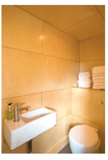
Bespoke Birch Plywood interior