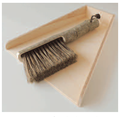
Innovative uses of Birch Plywood - by Geoff Fisher.