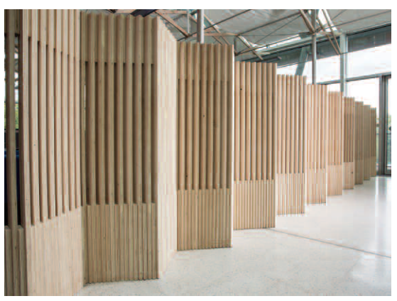
Birch Plywood screens and canopy at St Evelina's Chirldren's Hospital, creates a secluded, informal space for patients.