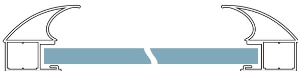
HORIZONTAL SECTION VIEW

When closed, doors should fit tightly against the wall or side panel. You can adjust the lateral door tilt using bolts located in the bottom rollers. Each bolt can adjust the door-to-bottom track gap 3 – 13 mm.